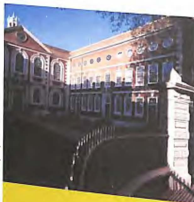
McCoy - Wynne & Associates