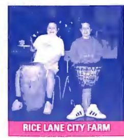
RICE LANE CITY FARM