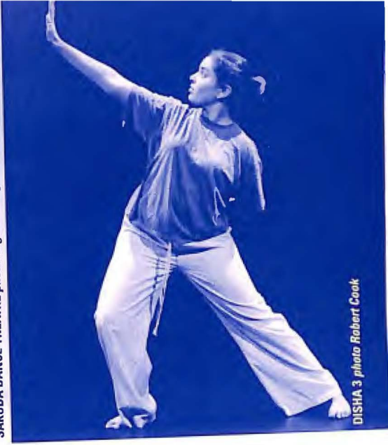
DISHA 3

The North West's third South Asian youth dance festival is a colourful and dynamic platform for different styles of South Asian dance current in this country. Presented in collaboration with the Chaturang initiative.