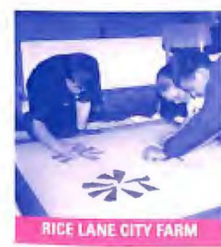
RICE LANE CITY FARM