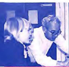
ALSOP HIGH SCHOOL