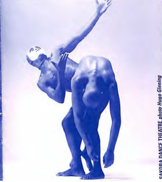
SAKOKA DANCE THEATRE

Presented by Nadey al Bluecoat, celebrating Arabic arts and culture on Merseyside.