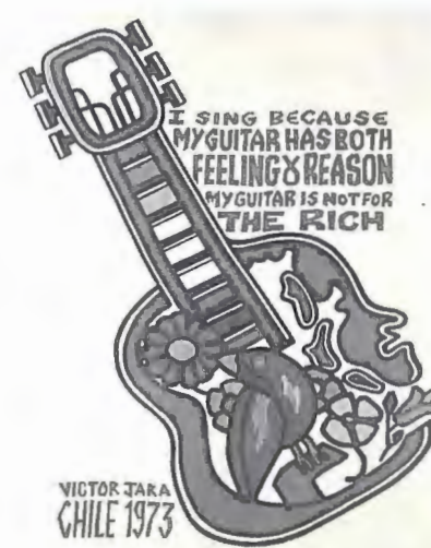
Peña for Chile