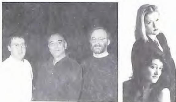
Atlas photo Tom Benjamin