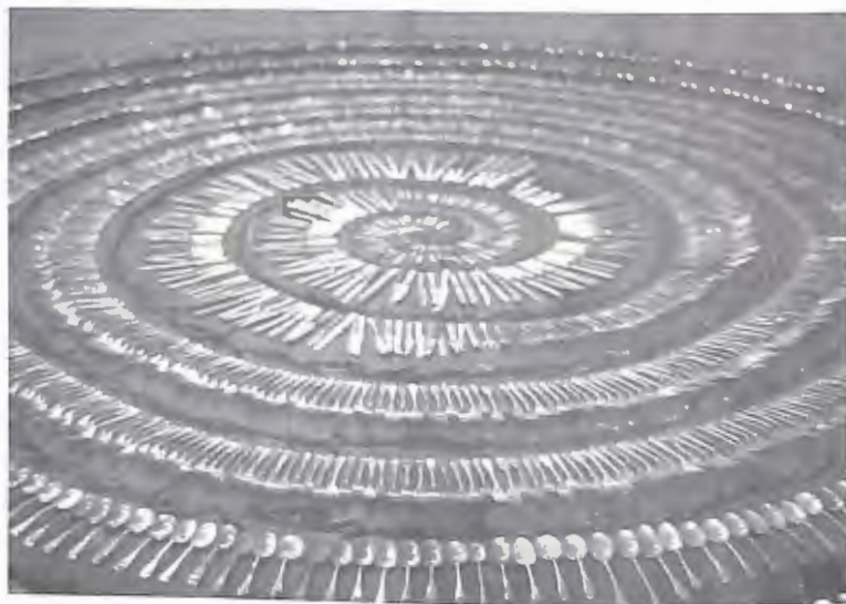
Simryn Gill Forking Tongues