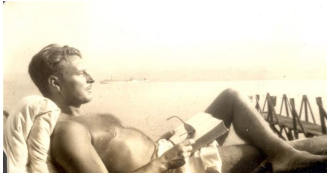
Above image: Malcolm Lowry reclining in a deck chair at Dollarton, 1945.