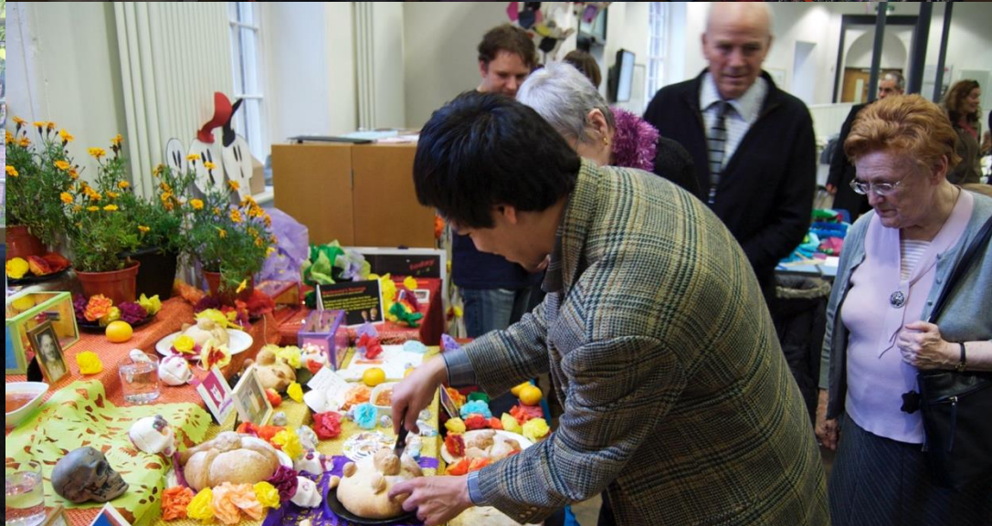
Participating in Altar for Malcolm Lowry at the Bluecoat, 2009