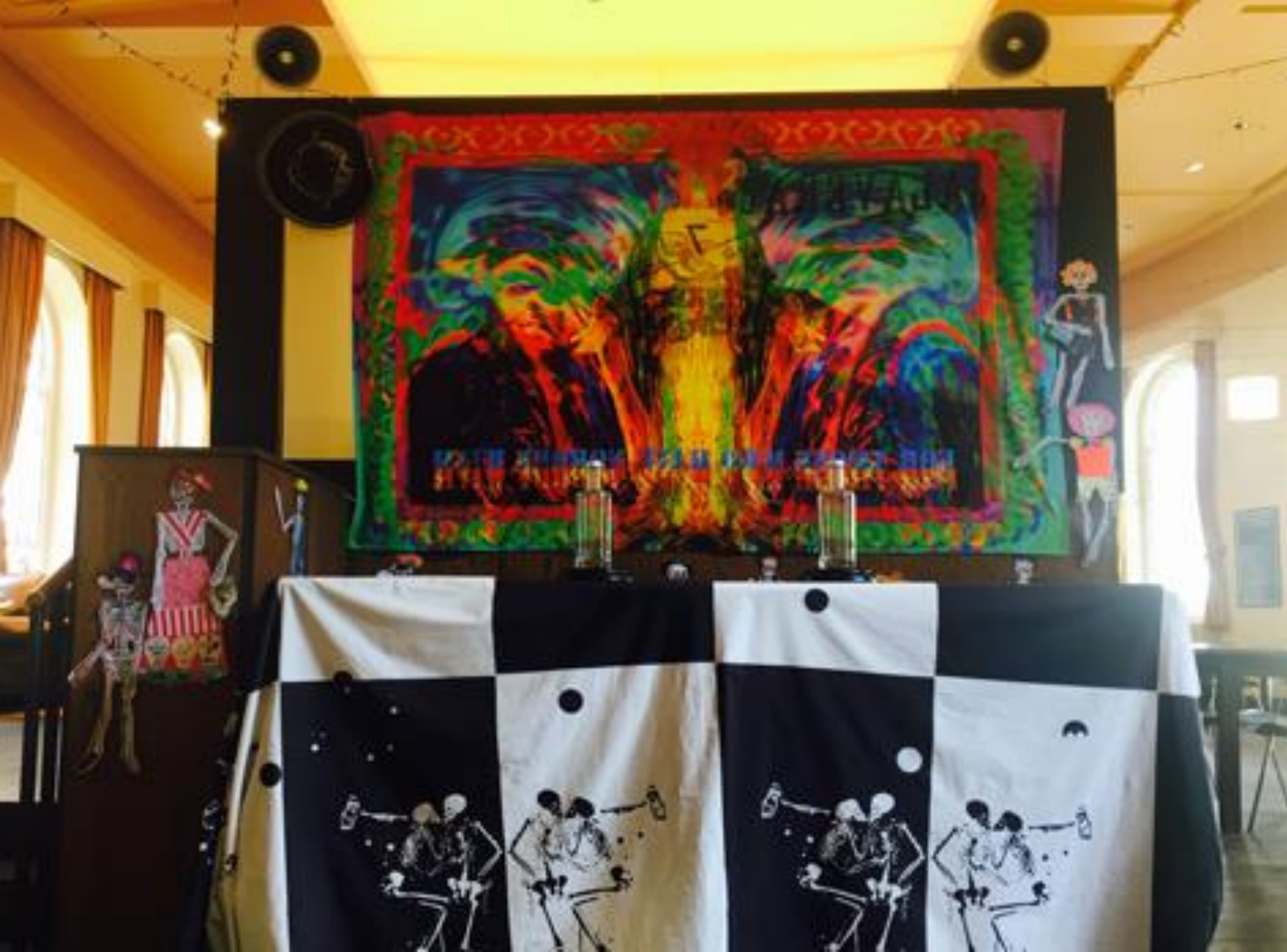
Shot Under the Volcano John Hyatt installation in the Bluecoat bistro for the 2017 Lowry Lounge (in collaboration with Uniform)